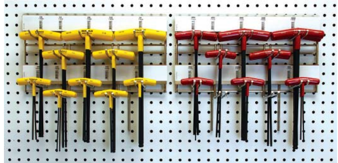
#94450 - T-Handle Singles Rack Only