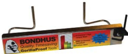
#94454 - Universal Base