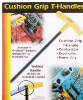
94064 - T-Handle Wall Tag

Hang the Wall Tag next to your display to show the T-Handle's features and benefits.