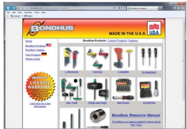
The new Bondhus products page

On the home page, we are spotlighting new products from Bondhus. The home page displays a product summary on one new product line and a link to more information on what's new at Bondhus.