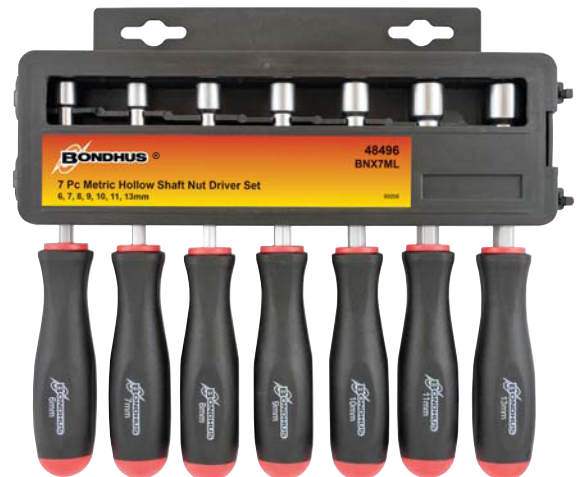
Item No. 48496 - 7 Pcs 6, 7, 8, 9, 10, 11, 13mm